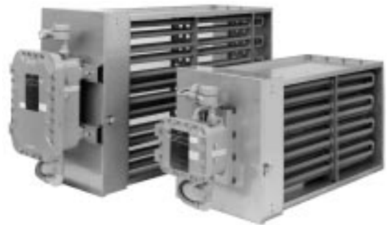
Figure 82. Series EP2 Explosion-proof Duct Heaters